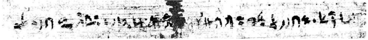
P. Brooklyn 37.1799 E verso