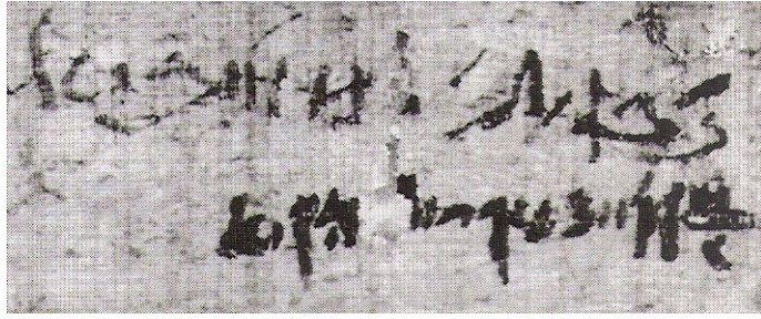
P. BM EA 10113 verso