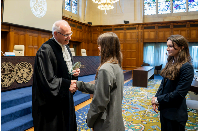
Finalist Team, Comenius University in Bratislava