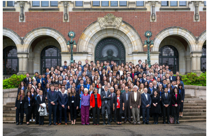
Telders 2024 Group Picture