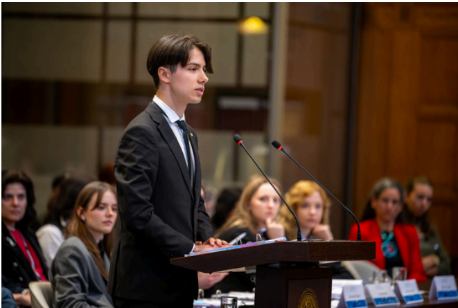
Speaker, National University of "Kyiv-Mohyla Academy"