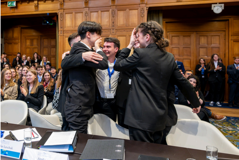
Final Round Winner, National University of "Kyiv-Mohyla Academy"