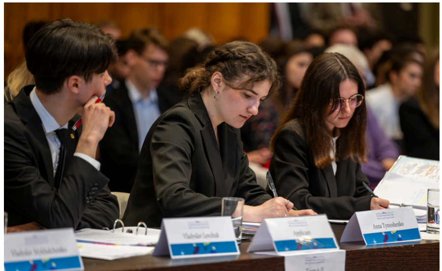
Final Round Winner, National University of "Kyiv-Mohyla Academy"